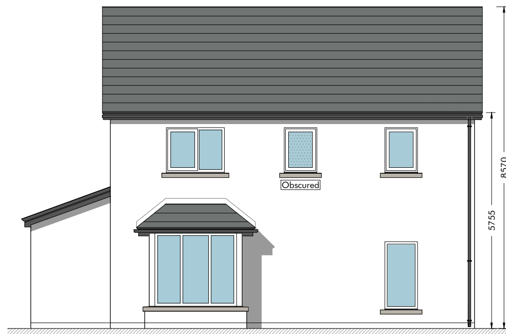
HOUSE TYPE: A SIDE ELEVATION