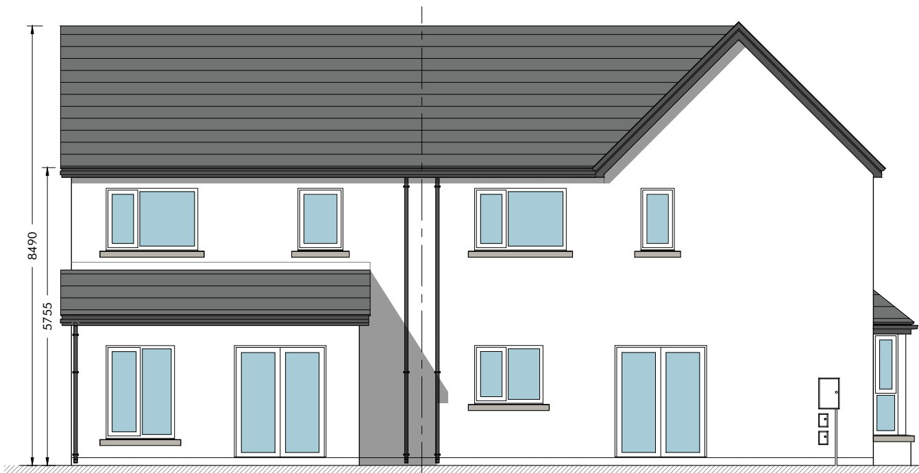
HOUSE TYPE: A1 REAR ELEVATION