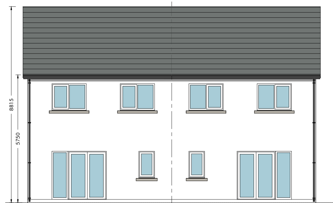
HOUSE TYPE: B REAR ELEVATION