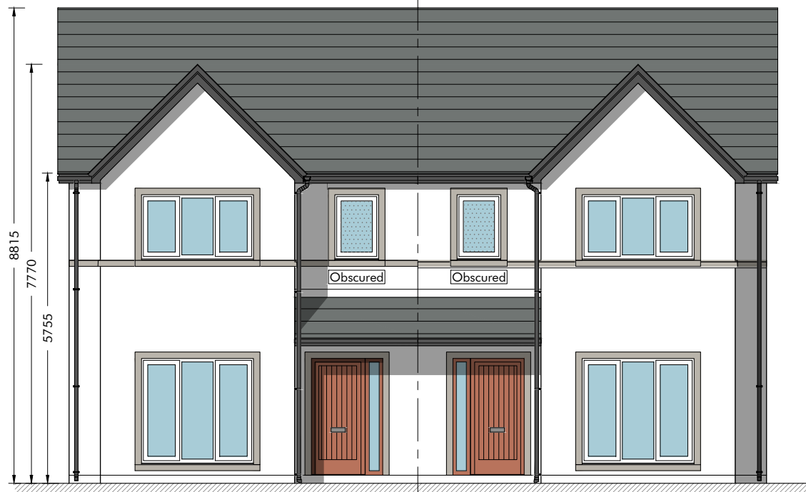
HOUSE TYPE: B FRONT ELEVATION