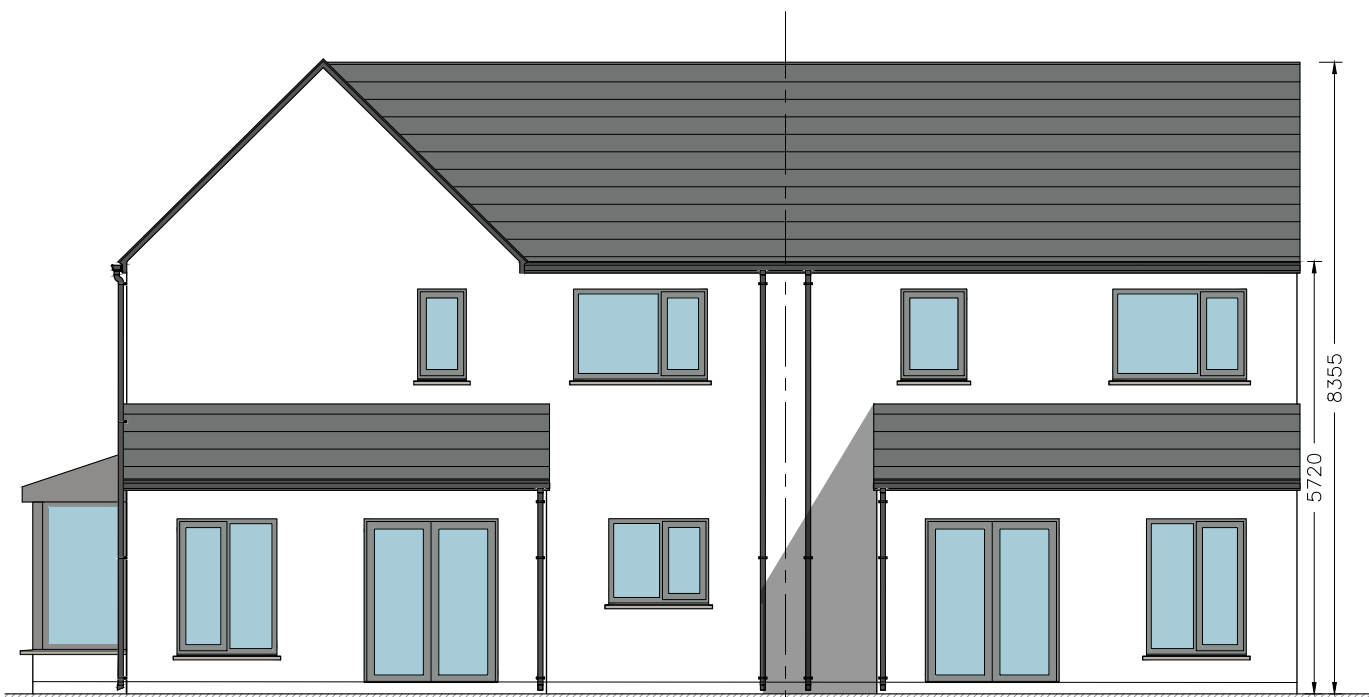
HOUSE TYPE: A2 REAR ELEVATION