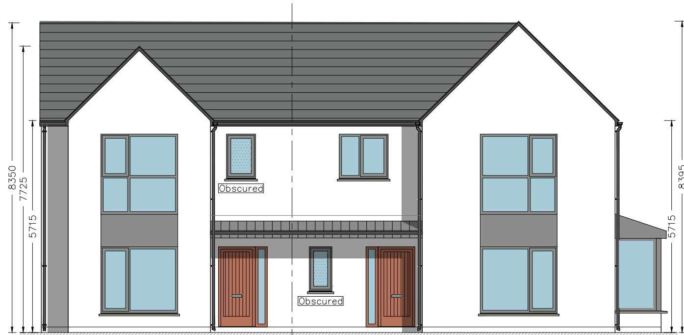
HOUSE TYPE: A1 FRONT ELEVATION