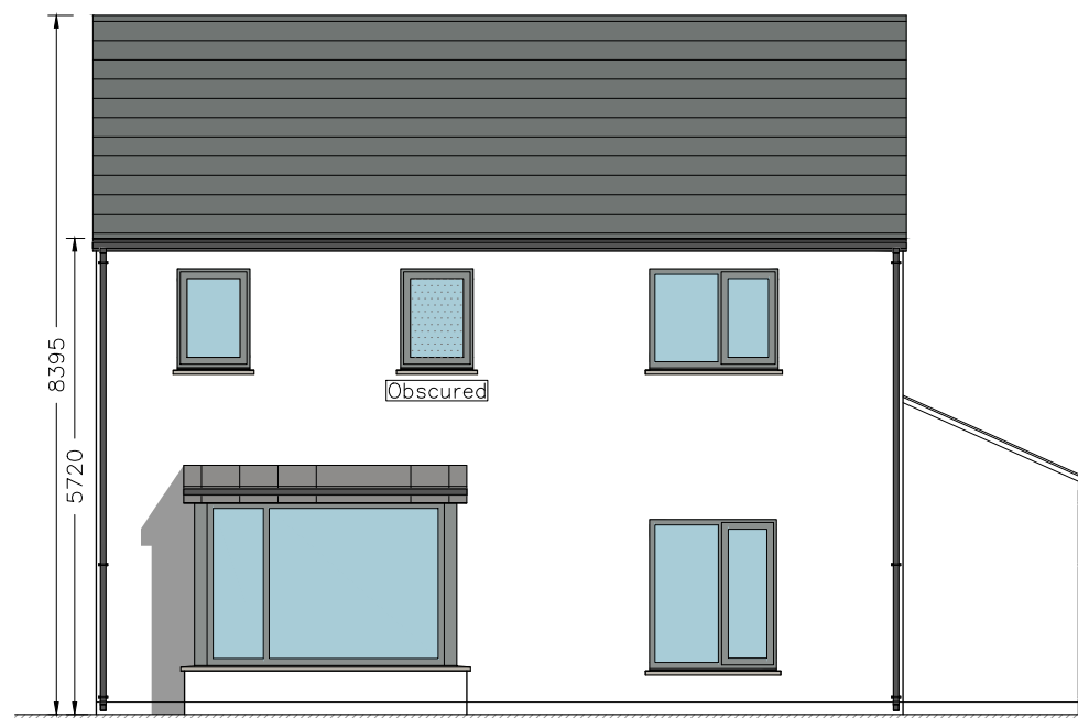
HOUSE TYPE: A2 SIDE ELEVATION